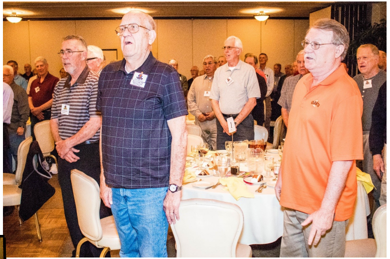
Above and below

□ Brown's Law of Physical Appearance - If the clothes fit, they're ugly.