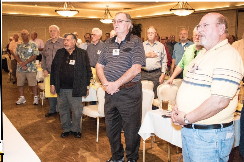
Members singing "God Bless America"

"Have you ever seen a twenty dollar bill all crumpled up?" asked the wife.