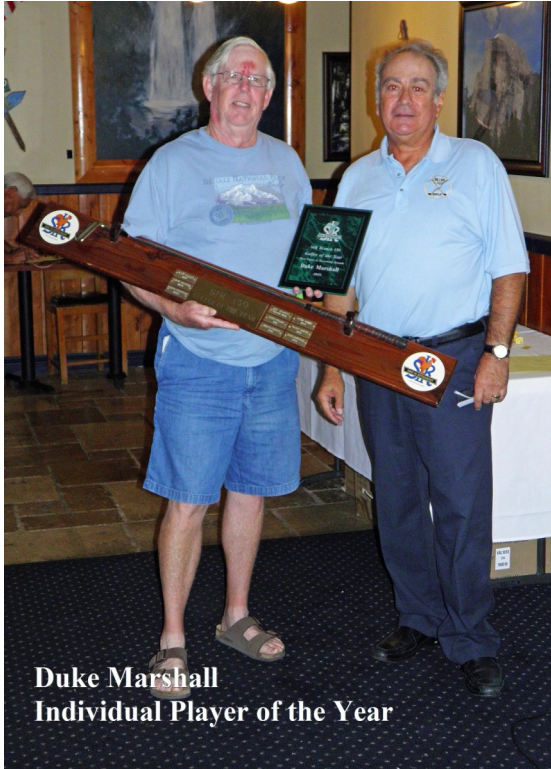
Duke Marshall Individual Player of the Year