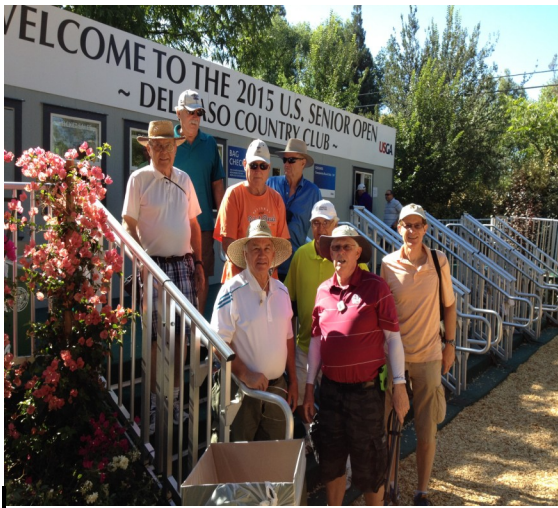
Entering Senior Open

Several men on the sick list this month. Practically all turned in by the telephone committee. Thank you gentlemen for helping me out. I could even use an update as they heal. I will leave out their maladies