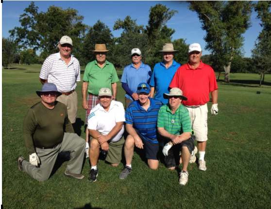
Getting ready to play Haggin Oaks.