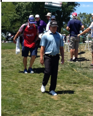
Crowd favorite Funk.