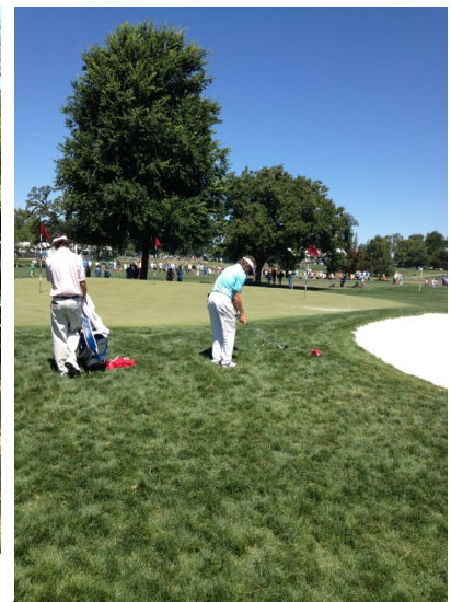
Langer practicing chipping from rough.