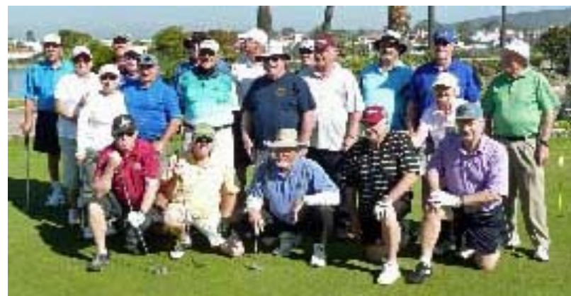
Golfers at Baja Mar (identity up to you)