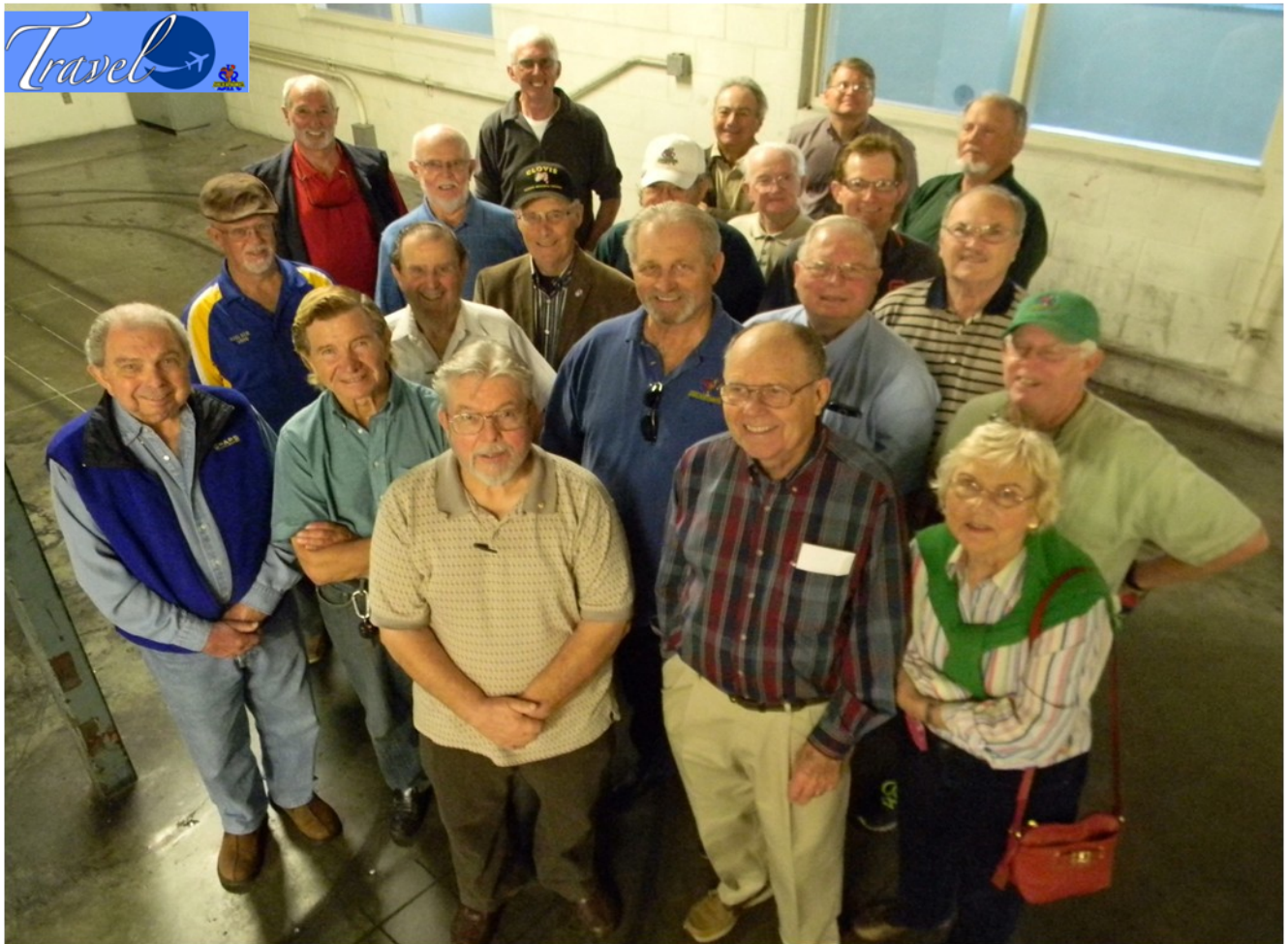
SIR 159 Members touring the Fresno Bee facilities