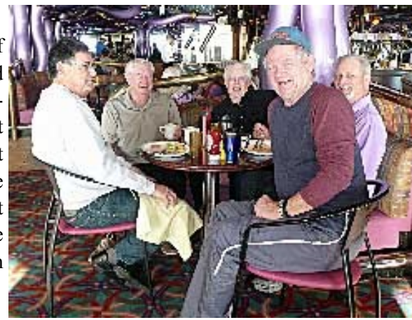
Golfers at the 19th hole

heard of! Of course, golf and alcohol were additional. Start planning for next year, 2016! We always go the first Monday after the Superbowl. Plan on joining us!