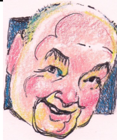
Big SIR Charlie

When the bread is to be broken, however, it must be in sufficient quantities to fill all the stomachs present, and of such quality that this filling will be pleasant. To do this reliably, we must have a count which is as (Continued on Page 2)