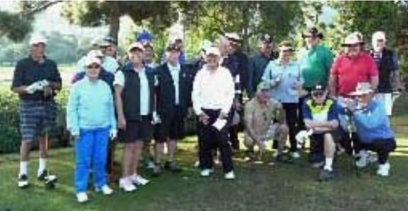
Golfers in Catalina (identity up to you)

The 2015 Golf Cruise was attended by thirty three folks. There were many golfers and several sophisticated and fun-loving wives. We were all aboard the Carnival Inspiration on Monday, February second and home in Fresno on Friday, February sixth. Twenty-five golfers played golf in Catalina and at Baja Mar (Pebble Beach) of Mexico.