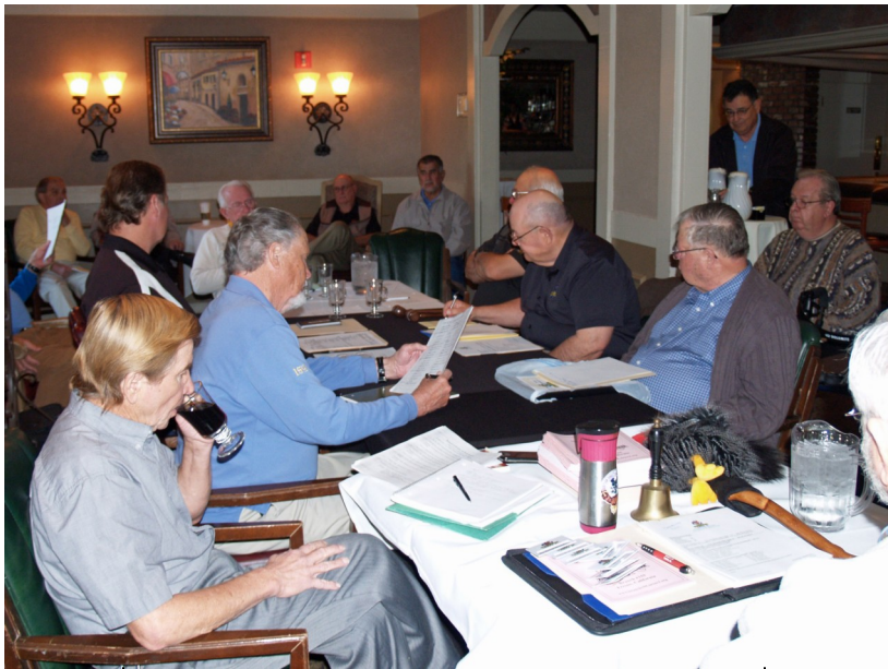
First Board Meeting at Pardini's