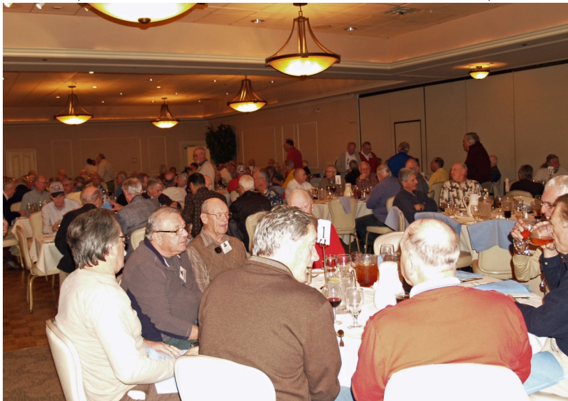
First Assembly in Dining Room