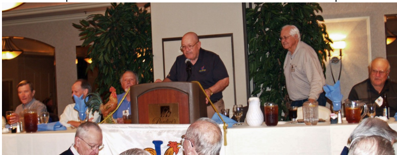
First Calling to Order

February Perry Puns : Subject: $7.00 Sex An Arizona couple, both well into their 80's, go to a sex therapist's office.