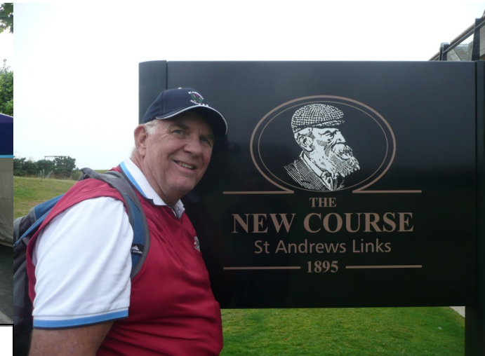
Howard Zinn at St. Andrews