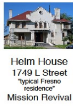
Helm House 1749 L Street "typical Fresno residence" Mission Revival

“things fresno” Celebrating National Historic Preservation Month SIR 159 in conjunction with Heritage Fresno join others on May 10th (Saturday)