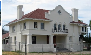
Alamo House $ 400 K later Open House noon-2 pm

Meux Home Museum Mother's Day Victorian Garden Tea, 11am Reservation: (559) 291-4520