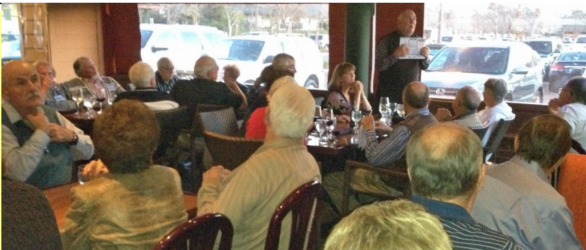
Top: Ladies Date Night in February Bottom: Guys at last luncheon helping with travel