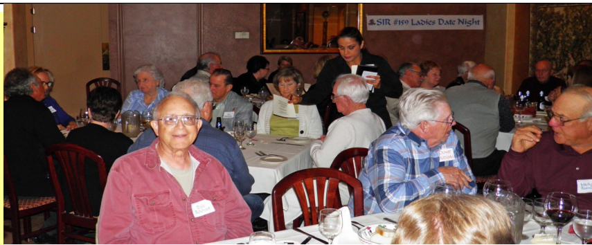
Date Night in January at Ovideo's