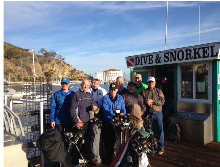
Golfers on the Cruise