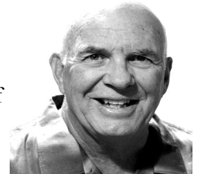
Little Sir Howard Zinn