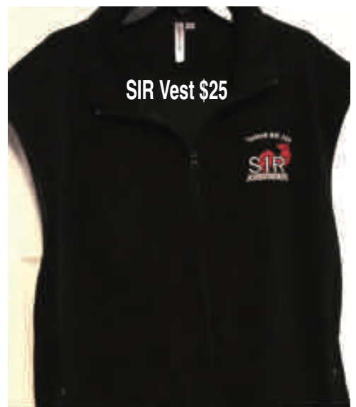
SIR Vest $25