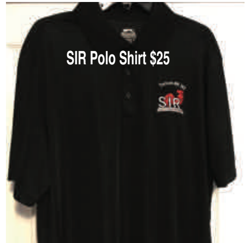
SIR Polo Shirt $25

Show your pride in SIRs, wear a hat, shirt, vest or jacket.. We have some hats and shirts in stock and will have them at our the next meeting, or call Rick Kin- dle at 209-652-8608 to pick these up... Vests and Jackets are special order, so we need your size. Also, if you want a different color for hats and shirts, these also need to be ordered.. if you have a special shirt you want embroidered, Russel Steeley can do this for $10... Call him at 209-922-8832 to arrange drop off... he is right here in Denair on Eastgate Drive,