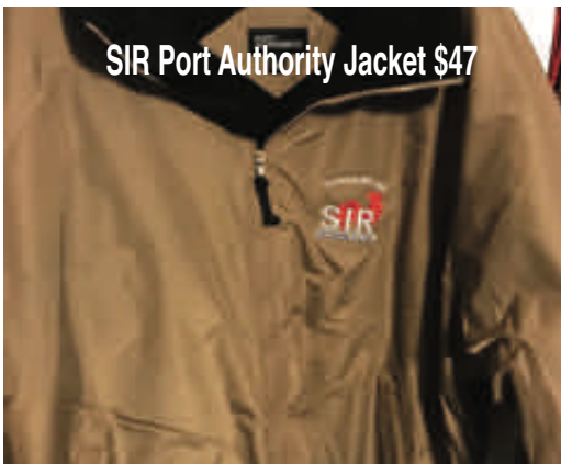
SIR Port Authority Jacket $47