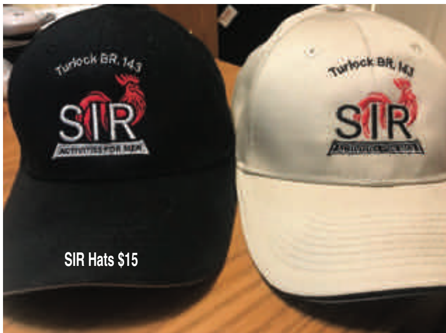
SIR Hats $15