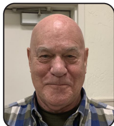
Rock Libby BIG SIR